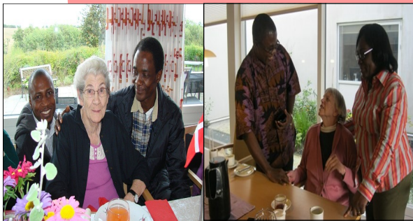
AA-LF Board Of Directors at an elderly home in Denmark