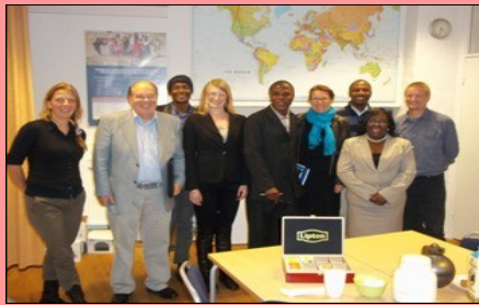
AA-LF Board Of Directors visits Denmark to hold discussions with AA-LF partners in Denmark on the way forward.

Minister of Employment and Social Welfare. Minister of Health The LO/FTF Council's Sub-Regional Office in Lome, Togo. FOA Copenhagen, Denmark Ghana TUC Parliamentary Select Committees, on Social Welfare & Health Ghana Government Pensioners Association. Silkeborg Social & Health-care College. Denmark Health Concern Ghana. Pentecost Hospital Aarhus Social & Health-care College. Denmark Accra Premier Lions' Club Presbyterian Church Women/Men Movements of Church of Pentecost. National Health Insurance Scheme Retired Commissioned Officers' Club of VAG